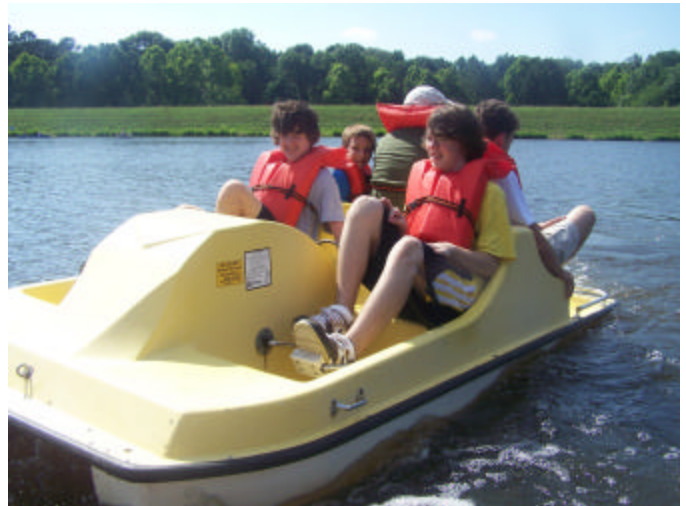
Youth enjoying the paddle boats at Bond Park

Youth celebrated the end of the school year with boating & a cookout at Bond Park in Cary. Canoes, paddle boats and sailboats carried everyone across the lake, frisbees flew through the air, and marshmallows roasted over the fire. It was a fun afternoon for youth and parents after a very busy year of serving, studying and praying together.